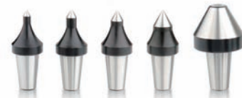
65型大子 65 type tips